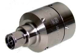
OMNI FIT™ Premium Connectors

OMNI FIT™ high performance connectors are designed for use with both CELLFLEX® (copper) and CELLFLEX® Lite (aluminium) cables. They are designed specifically to provide the highest quality connector-cable interface while simplifying and speeding up connector attachment. All RFS connectors are fully tested for mechanical and electrical compliance to industry specifications. The N connector meets all technical requirements and covers high frequencies as well as legacy applications. Sealing against outer conductor and jacket by means of O-Ring and 360° compression fit. Multifunctional, self-lubricating HighTech polymer assembly locks on cable corrugation, avoids electrochemical potential differences and compression-fits to the jacket.